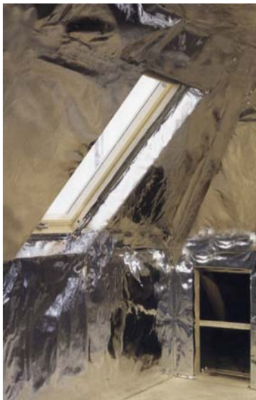
HRM I being installed in an attic room prior to fitting plasterboard

There are many types of insulation available that reduce heat gain and heat loss. Some materials provide greater resistance to heat transfer than others depending on the mode of heat transfer: radiation, conduction or convection.