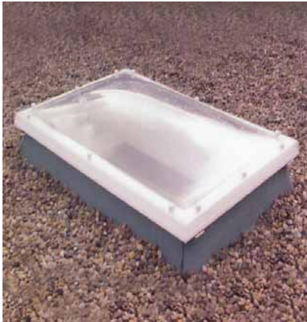
Celeste flat roof window

Triple skin flat roof windows - Technical information and model selection