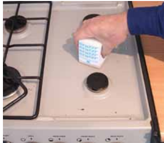
2. Dip the erazzr into the water and rub grime away.