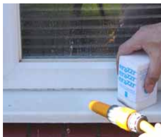
2. Rub surface with the erazzr whilst running a trickle of water over the work area.