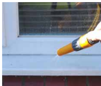
1. Hose down the grimy surface to remove any grit that may scratch the surface.

After using erazzr on caravans and portable homes, it is recommended a good quality bodywork polish is applied to impede the build-up of grime and algae