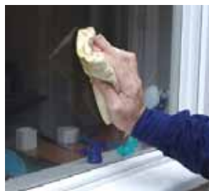
3. Finish with a shammy leather or scrunched up newspaper