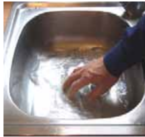
3. Add more water and rinse away loosened grime.