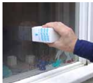
2. Rub away grime with the erazzr