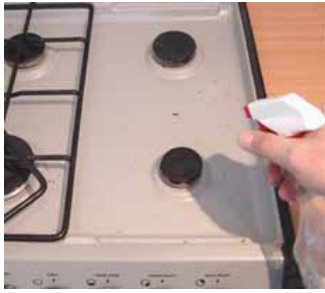
1. Using a sprayer, wet down the grime surface.

PLEASE NOTE, SOME STAINLESS STEEL SURFACES HAVE A LAQURED FINISH APPLIED BY THE APPLIANCE MANUFACTURER. ALWAYS TEST A SMALL AREA USING A DAMPENED erazzr BEFORE GENERALLY RUBBING THE SURFACE. UNPLUG ELECTRICAL APPLIANCES OR SWITCH OFF THE ELECTRICITY SUPPLY