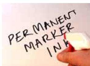
Spray with water