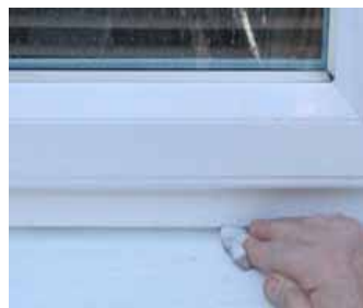
3. Use a cut erazzr pad to access tight corners.