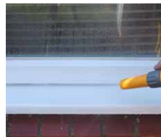
3. Finally rinse away loosened grime.