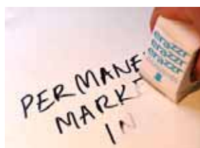
Rub away with erazzr