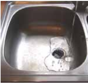
1. Put the plug in the sink and add about 10mm of warm water.