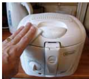
Plastic chip fryer