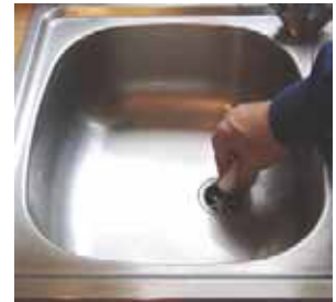
4. Use a damp erazzr pad cut from the block to access difficult corners