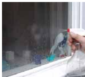
1. Using a sprayer wet the window glass with clean water

If the rubbing face of the erazzr block becomes very contaminated, simply cut it off using a sharp kitchen knife to create a new face – fig 2, page 1. The holder can be used as a cutting guide.