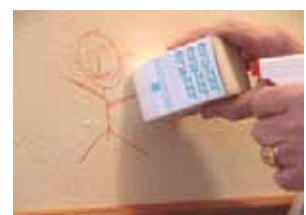
Rub away crayon on painted wall