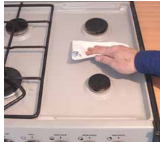
3. Dry surface with a paper kitchen towel