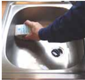
2. Dip the erazzr into the water and rub grime away.