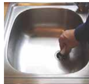
4. Use a small damp erazzr pad to access difficult corners