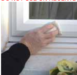
1. 20mm thick erazzr pad can be used on window frames