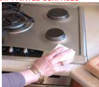
2. Rub surface with the erazzr whilst keeping the work area wet.