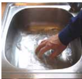
3. Add more water and rinse away loosened grime.