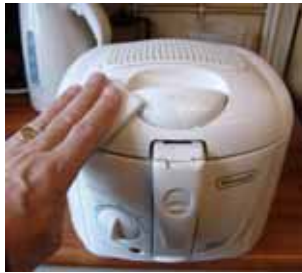
Plastic chip fryer