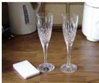
3. Use a cut erazzr pad to brighten up crystal glasses