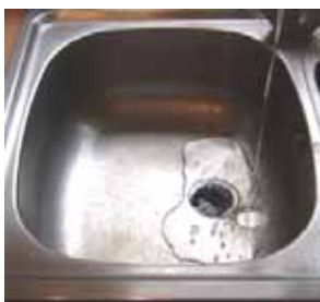
1. Put the plug in the sink and add about 10mm of warm water.