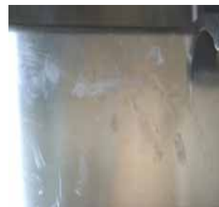
4. Remove grubby marks from stainless steel surfaces.