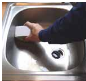
2. Dip the cut erazzr pad into the water and rub grime away.