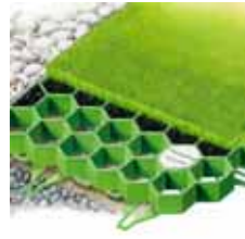
Grass or gravel reinforcement grid