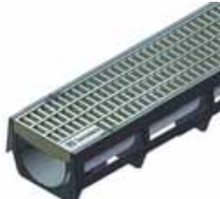
Thermoplastic Drainage channel