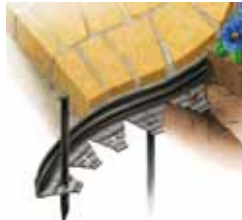
Border edging systems. Plastic and galvanised steel