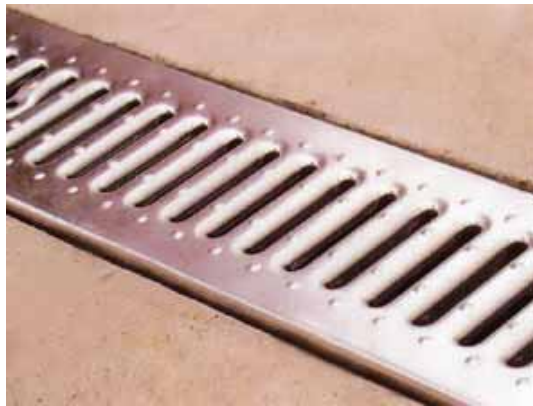
Detail of slotted, galvanised steel grating.