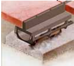
Slotted Drainage channel