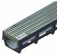
Thermoplastic Drainage channel