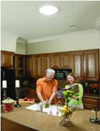
▲ Optional supply Optiview ® diffuser provides a spreading "clear" lighting effect