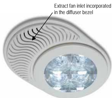
Vusion™ Diffuser incorporated in the Ventilation Add-On Kit. OpiView® Diffuser as shown optionally available