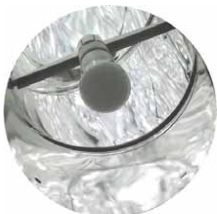
Electric Light Add-On Kit installed inside the tube

The nbs Special Offer , Solatube® 160 DS is supplied with everything you need for installation – All you may have to specify extension tubes for your particular project – see below.