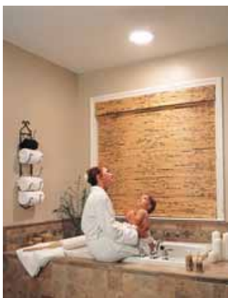
▲ Standard supply Vusion™ Diffuser provides a diffuse "soft" lighting effect