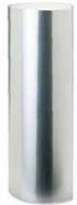
Each Spectralight® Infinity Extension Tube is 610mm long. Each tube added increases the installed distance by 560mm.

Each tube added increases Installed distance by 560mm.