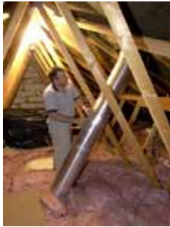
▲ Three Spectralight® Infinity extension tubes used here

The Solatube® 160 DS specification is supplied with a top and bottom tube assembly that together give an install distance (ceiling to roof) of up to 400mm (16"). This is generally sufficient for vaulted ceilings or very shallow pitch roofs. For greater install distances you will need to purchase additional Spectralight® Infinity Extension Tubes to meet your required install distance. You can calculate your install distance by measuring the internal distance between your ceiling and roof (see distance X in the picture on left). Use the chart below to calculate the number of extensions. By matching your roof void distance X to the appropriate tube length in the Install distance column. Always go to the next size up – the tubes are telescopic. For example if measurement X is 1650mm you will have to order three Spectralight® Infinity extension tubes. Please contact us for advice for install distances greater than those shown in the table below.