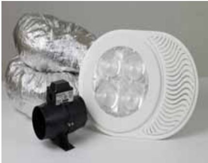
Photo showing ceiling bezel with flexible ducting and inline extract fan unit

The ventilation kit is complete with ceiling bezel with Vusion™ diffuser and extract fan inlet, 2.5m noise-reducing flexible ducting, inline extract fan unit and universal roof exit vent. The nbs Special Offer specification also includes the Pull-cord manual ON/OFF switch.