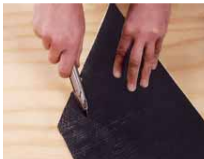
Easily cut with a sharp knife

*** Ubiflex Fixing Wedges – 25 wedges per pack