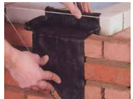
Easily formed – will not spring back