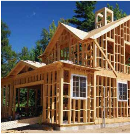
Black Mountain – a natural choice timber frame homes

Purchase this product from www.nbs-home.co.uk