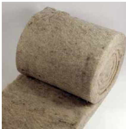
Black Mountain Insulation in a roll