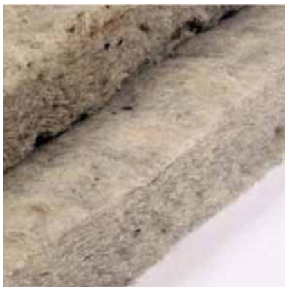
Black Mountain Batt Insulation

Because wool has the ability to regulate moisture and draw moisture away from the internal space of the home, it is the ideal insulation in timber frame constructions. The natural synergy between wood and wool delivers both energy efficiency and health and safety advantages.