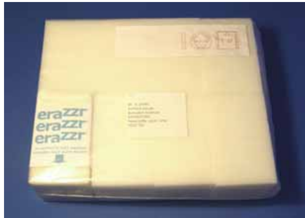
The erazzr® pack

Please note, although the erazzr looks like a sponge it should not be used like one. An erazzr works like a large pencil rubber, in combination with water, it literally erases - rubs away grime and grubby marks. Like a pencil rubber it too wears away with use. Different methods are employed each tailored to give the best results. The more common methods are described in the nbs instructions PDF data sheet.