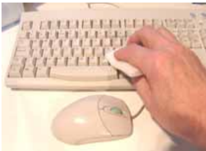
▲ 10mm slice of erazzr® removes grubby marks from keyboards