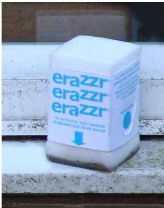
erazzr® erasing block can remove years of grime from PVC-u window frames without damaging the surface

You have discovered the most efficient, longest lasting, cost effective, chemical and detergent free surface renovating system of its type.