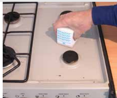
▲ Scratch free renovation of cooker tops – enamel or stainless steel