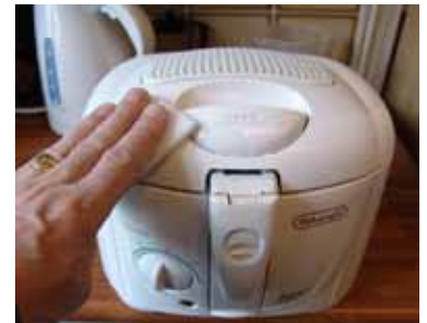
▲ Removes grime and grease from household appliances