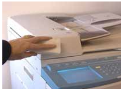
▲ Removes grime from home office equipment