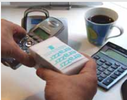
▲ Safely removes dirt from telephones