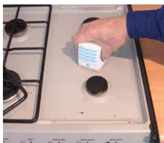
2. Dip the erazzr into the water and rub grime away.