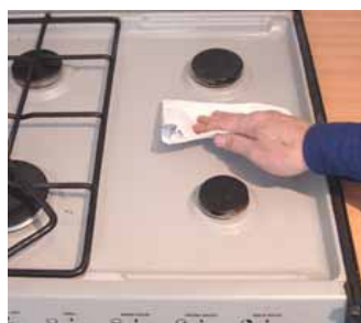
3. Dry surface with a paper kitchen towel