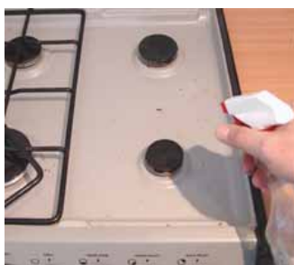
1. Using a sprayer, wet down the grime surface.

PLEASE NOTE, SOME STAINLESS STEEL SURFACES HAVE A LAQURED FINISH APPLIED BY THE APPLIANCE MANUFACTURER. ALWAYS TEST A SMALL AREA USING A DAMPENED erazzr BEFORE GENERALLY RUBBING THE SURFACE. UNPLUG ELECTRICAL APPLIANCES OR SWITCH OFF THE ELECTRICITY SUPPLY