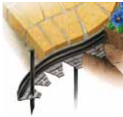
Border edging systems. Plastic and galvanised steel