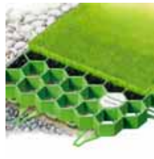
Grass or gravel reinforcement grid