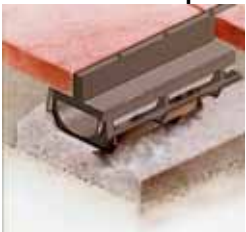
Slotted Drainage channel