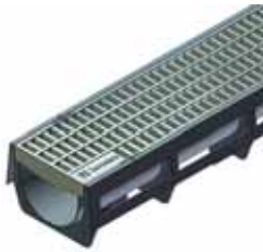
Thermoplastic Drainage channel