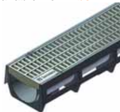
Thermoplastic Drainage channel