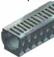
RECYFIX 100 Drainage channel with galvanised steel gratings