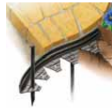
Border edging systems. Plastic and galvanised steel