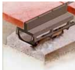
Slotted Drainage channel