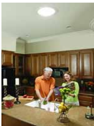
▲ Optional supply Optiview ® diffuser provides a spreading "clear" lighting effect