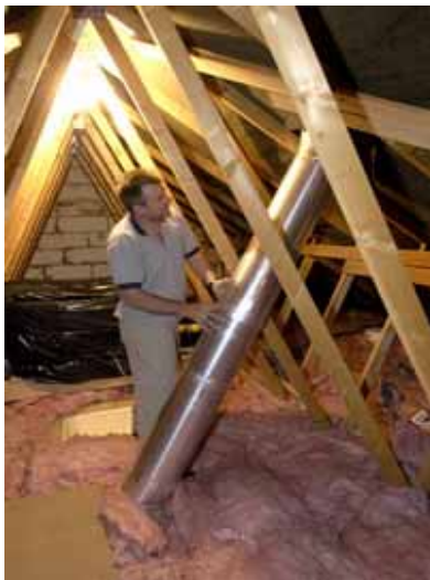
▲ Three telescopic extension tubes used here