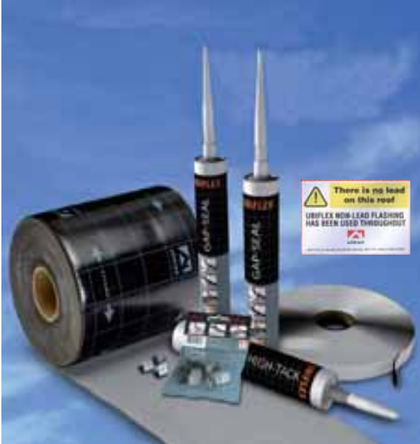
Ubiflex flashing comes in rolls available in Grey (as shown) Black or Terracotta finish. Terracotta is only available via special quotation.

The Ubiflex system is conveniently available from www.nbs-home.co.uk