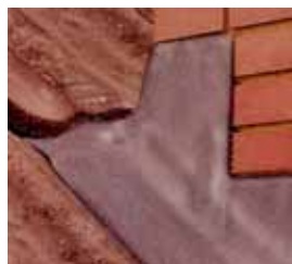
Chimney flashing – Grey finish