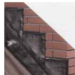
Chimney flashing –Black finish